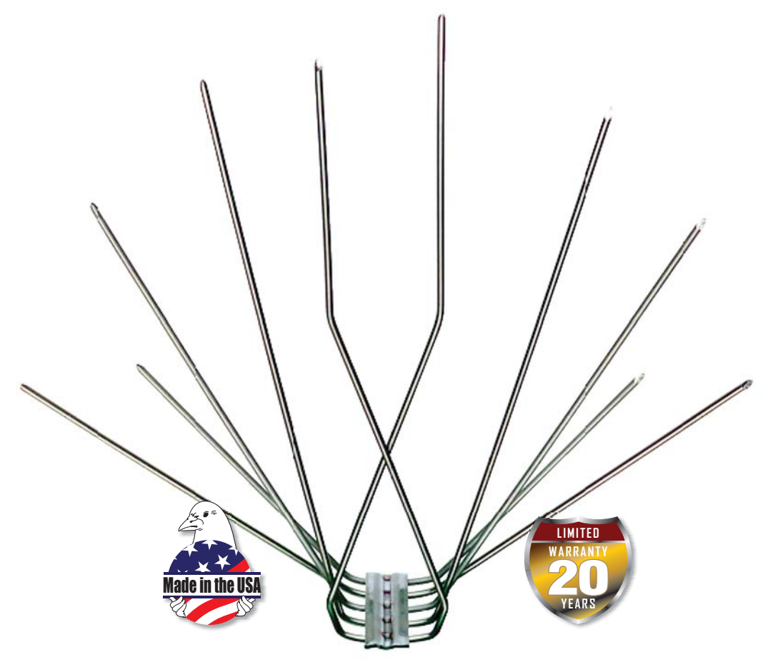
Image shows the 5 wires per inch, gap free coverage. (Shown 20% larger than actual size)